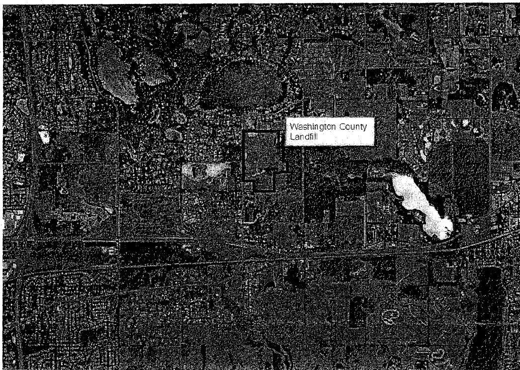
Figure 1. Location of the Washington County Landfill

The Washington County Landfill is a closed, unlined landfill that contains approximately 2.57 million cubic yards of mixed municipal solid waste. The Landfill was permitted by the MPCA and is located in the City of Lake Elmo in Washington County, Minnesota (see Figure 1). The permitted area is 110 acres while the waste footprint comprises about 35 acres. Response actions previously implemented to address releases at and from the Landfill include an active gas extraction system used to control the migration of landfill gas, a ground-water treatment system used to contain and treat releases of volatile organic compounds (VOCs) to the ground water, and provision of carbon treatment or connection to a public water supply for residences with wells affected by ground water contamination from the Landfill.