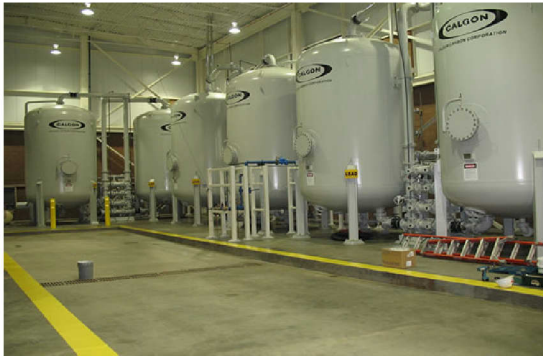
Image: City of Oakdale water treatment plant

PFCs are chemicals used to make products that resist stains, grease, water, and heat. Some public and private drinking water wells in the East Metro were found to be polluted with PFCs in 2004. A public health intervention reduced PFCs in drinking water to below health-based limits.